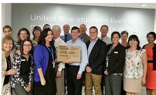
Valley of the Sun United Way's Ending Homelessness Advisory Council.

We prepared Arizona for its first infusion of federal Housing Trust Funds, bringing in national experts and convening focus groups to ensure it addresses Arizona's most dire housing needs.